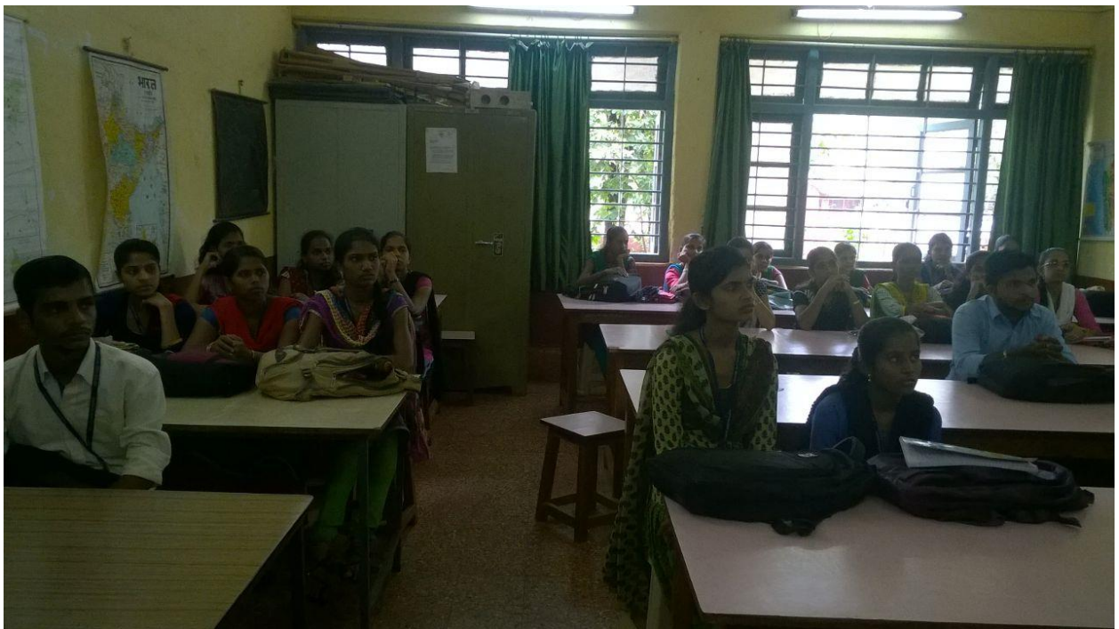
Students participated in one day workshop on Avishkar Research Convention