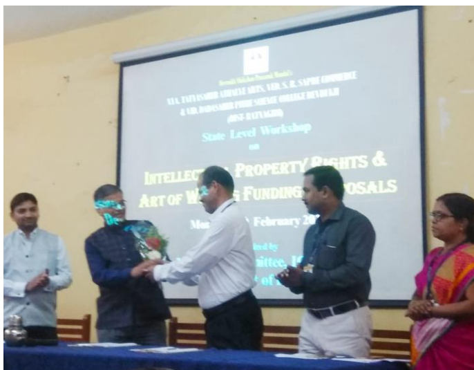
State level workshop on “Intellectual Property Rights and Art of Writing Funding Proposals” organized on February 11, 2019