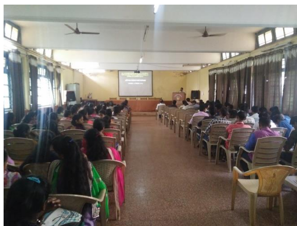
One day workshop on Avishkar Research Convention organized on October 09, 2018.